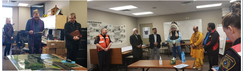
Faith & cultural leaders bless the ECC at the beginning of the pandemic response.

For more information, visit chestermere.ca/covid19 .